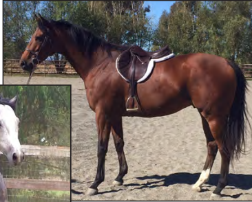
"Noah," aka King Maya, 6 year old OTTB