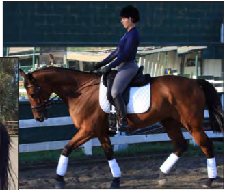
"Hudson," 16 year old Warmblood