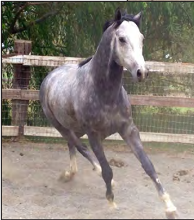
"Rush," 5 year old OTTB

Featured horses available for adoption, out of our Los Angeles and Dixon, CA facilities